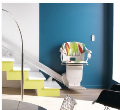
Stairlifts & Home Lifts