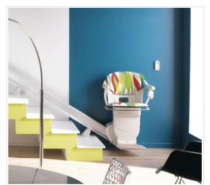
Stairlifts & Home Lifts